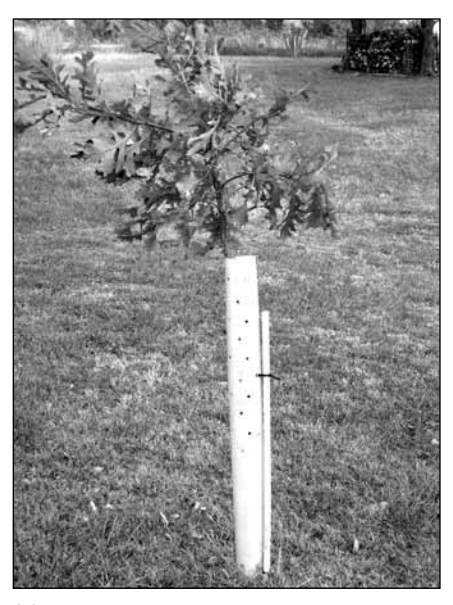
Tree tubes protect seedlings and foster growth.

To establish, simply place the tube over the plant so that the vents (the pre-drilled holes in the tubes) are at the top. Slide the provided stake through the zip-ties and pound the stake into the ground at least 12