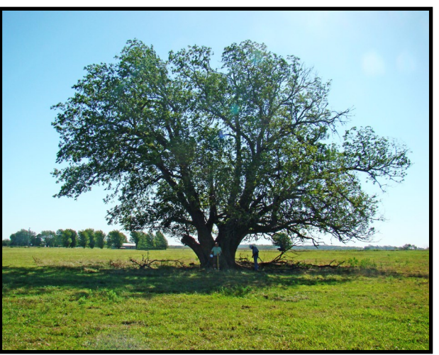
State Champion White Mulberry Douglas County