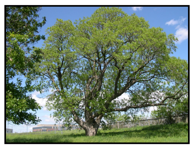
National Champion Western Soapberry Johnson County