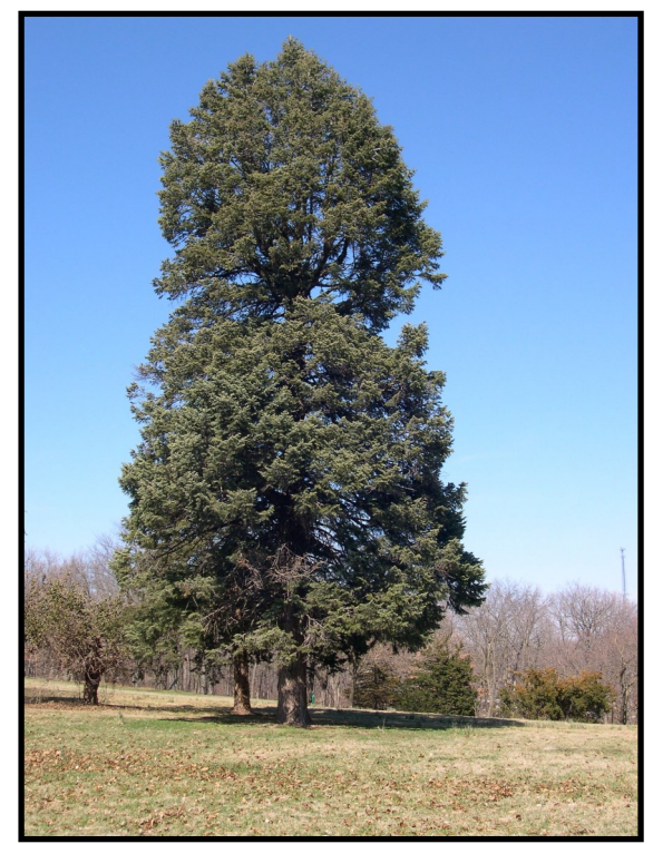
State Champion White Fir Wyandotte County