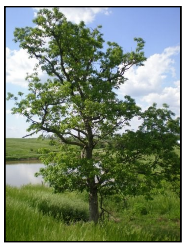
State Champion Dwarf Chinkapin Oak Brown County