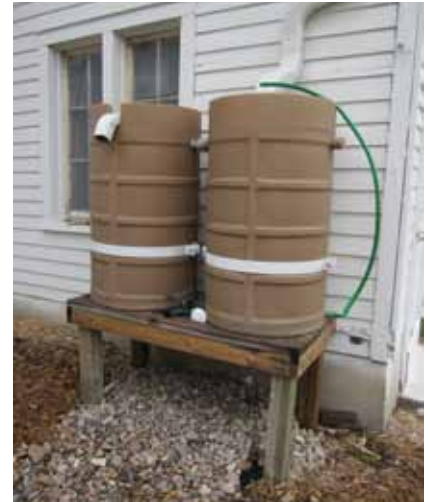
Figure 7. Rain barrels with overflow to rain garden (Hastings, Neb.)

Rain barrels are small tanks that store runoff, usually from a roof. Rain barrels are commercially available or adapted from existing barrels, sit above ground, and typically have a capacity of 55-100 gallons. While rain barrels are a good introduction to rainwater harvesting, they are limited in the amount of rainwater held. Small water storage units will fill quickly. For this reason, an overflow to move excess water away from building foundations is needed. Overflow water can be directed to additional linked storage units, or ideally to a rain garden, bioretention basin, or bioswale (Figure 7).