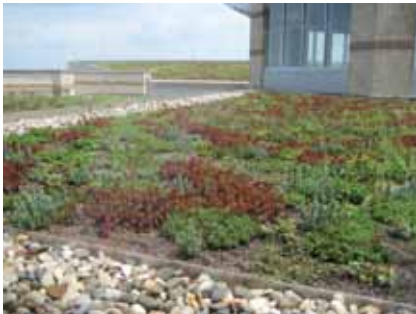
Figure 5. Green roof (Omaha, Neb.)

Green roofs are vegetated roof systems. They commonly consist of drought-tolerant plants, a layer of growing media, a root barrier, a drainage system, and a waterproof membrane on top of the roof deck. Green roofs directly intercept and absorb rainwater, provide insulation, and moderate rooftop surface temperatures. They may also extend the life of the roof membrane due to decreased exposure to temperature extremes, weather, and ultraviolet light. Green roofs can only be installed on buildings with the structural integrity to support the additional weight (Figure 5).