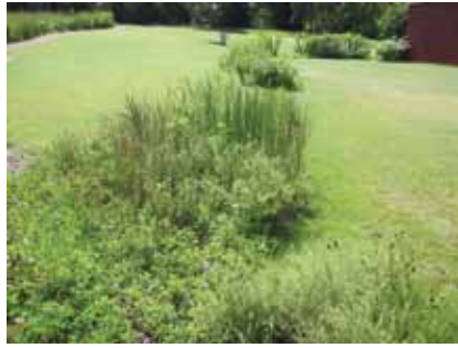
Figure 3. Bioswale (Lincoln, Neb.)

to as bioswales, enhanced swales, grassed swales, or water quality swales (Figure 3).