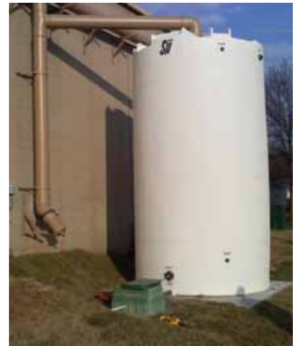
Figure 8. 6,000 gallon cistern (Papillion, Neb.)

Dry wells are permeable underground structures or buried volumes of gravel that store and then slowly release captured rainwater into the surrounding soil.