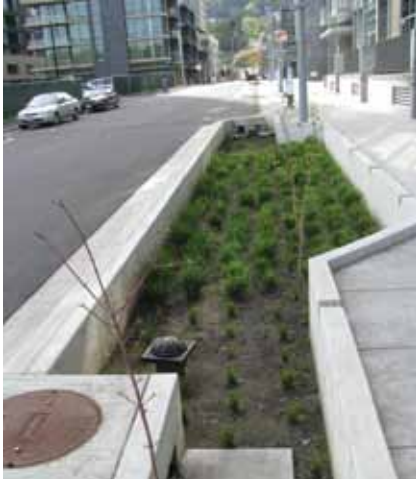
Figure 4. Stormwater planter (Portland, Ore.)

Stormwater planters are containers typically installed at or beneath street or sidewalk level in which trees and other types of plants are planted. Runoff is directed into the planter box where it is filtered by soil and vegetation and then discharged into a storm drain system through an overflow or underdrain. This helps remove pollutants and slows the flow of stormwater entering a storm drain system (Figure 4).