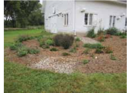
Figure 1. Rain garden (Hastings, Neb.)

A rain garden is an ornamental garden planted in a shallow depression that is designed to hold water for a short time (12-48 hours) before it drains away. These typically have berms on three