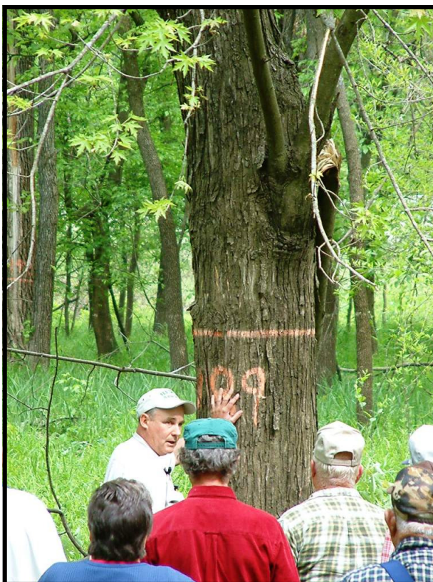
Tree Farm Field Days and Workshops provide helpful information to woodland owners