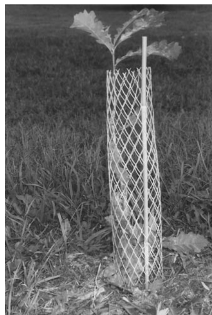
The correct way to install rabbit protective tubes.

Although they have been used successfully on many plantings, occasionally wildlife have pulled out the stakes or chewed on the tubes or stakes.