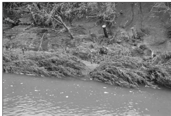
Figure 1. Willow cuttings shortly after installation.

As these cuttings sprout, they provide wildlife cover, begin shading the stream, and serve as cover for fish. Using willow cuttings to control streambank erosion is most effective when incorporated into a “systems approach” to land and water management. This systems approach should include controlling runoff and reestablishing a riparian forest buffer along the stream.