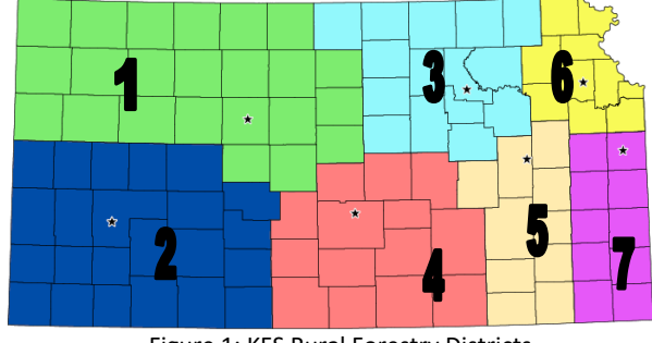
Figure 1: KFS Rural Forestry Districts

Plant origin is indicated by the color of each species name. Though a few species chosen for this list are introduced/exotic, they were included because they have not demonstrated a tendency to spread aggressively and because they may fill a specific niche where native alternatives are lacking.