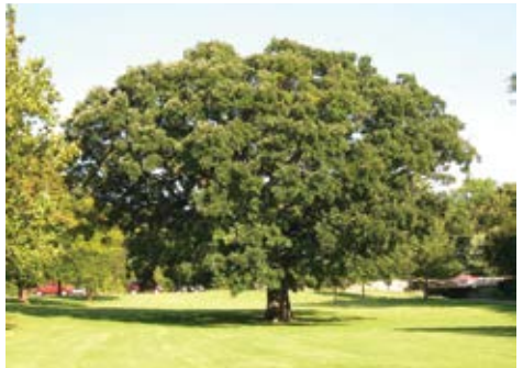
Bur Oak Height: 50-80' Soil: moist to dry. Adapted statewide. Full sun. Slow to moderate growth rate. Used for windbreaks, timber production, and wildlife habitats.