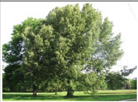
Cherrybark Oak Height: 50-60' Soil: Deep, fertile well-drained soils. Tolerant of clay soil. Adapted to southeastern Kansas. Relatively quick growing. Has value in windbreaks, timber, wildlife and as firewood.