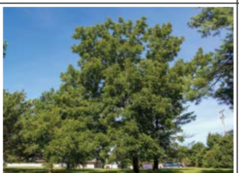
Black Walnut Height: 50-90' Soil: deep, moist, well-drained. Adapted statewide. Full sun. Moderate growth rate. Used for timber, firewood production, and wildlife habitat.