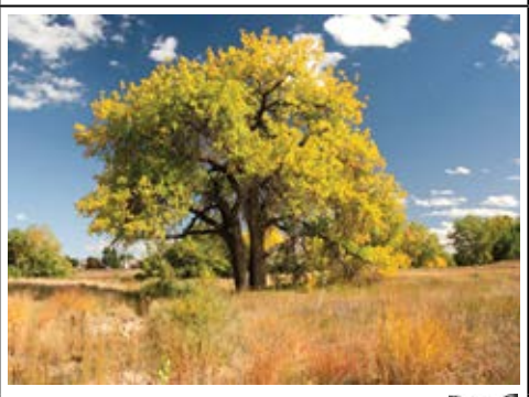
Cottonwood Height: 70-100' Soil: wet to well-drained. Adapted statewide. Full sun to partial shade. Rapid growth rate. Used for windbreaks, streambank stabilization, timber, and firewood. Excellent wildlife habitat.