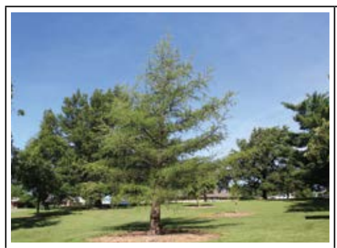
Baldcypress Height: 60-100' Soil: wet to moderately dry. Adapted to eastern half of Kansas. Full sun to partial shade. Moderate growth rate. Used for streambank and wildlife habitat.