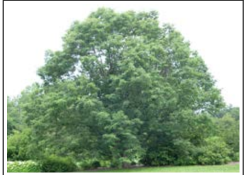
Chinkapin Oak Height: 30-60' Soil: well-drained to moderately dry. Adapted statewide. Full sun. Slow to moderate growth rate. Excellent wildlife habitat. Produces a low-spreading crown and low branching pattern.