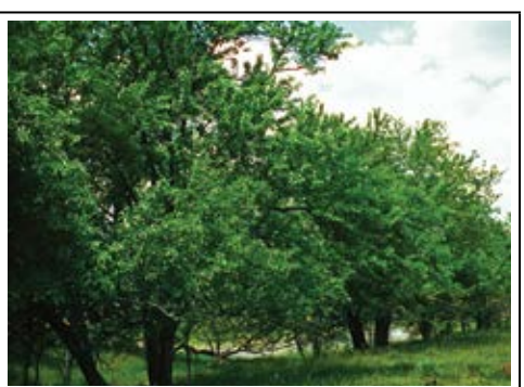
Osage Orange Height: 20-40' Soil: Moist soil preferred, but can do well on droughty, alkaline soils. Adapted statewide. Timber is used for fence posts and firewood. Also used in windbreaks.

Northern Red Oak Height: 50-70' Soil: moist, well-drained. Adapted to eastern half of Kansas. Full sun. Moderate growth rate. Used for timber , wildlife, firewood, and windbreaks.