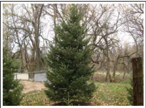
Black Hills Spruce Height: 20-40' Soil: Broad range of soils. Adaptable to the northern half of Kansas. Used for evergreen component in windbreaks and Christmas trees.