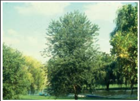
Black Cherry Height: 50-60' Soil: moist, well-drained. Adapted to eastern third of Kansas. Full sun. Fast growing – 2 to 4 feet a year when established. Used for wildlife and timber.