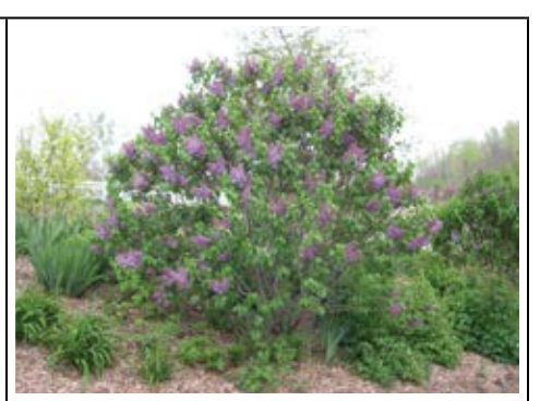
Lilac** Height: 8-12' Soil: well-drained. Adapted statewide. Full sun to partial shade. Moderate growth rate. Used in windbreaks and for wildlife habitat. Very drought tolerant.

Golden Currant Height: 3-5' Soil: well-drained to dry soils. Adapted statewide. Full sun to partial shade. Moderate growth rate. Excellent for wildlife habitat and drought tolerant.