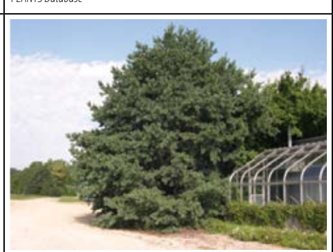
Southwestern White Pine Height: 35-50' Soil: dry, well-drained. Adapted statewide. Full sun. Moderate growth rate. Used for Christmas trees and windbreaks.

Windbreaks for Wildlife, MF805. www.bookstore.ksre.ksu.edu/pubs/MF805.pdf