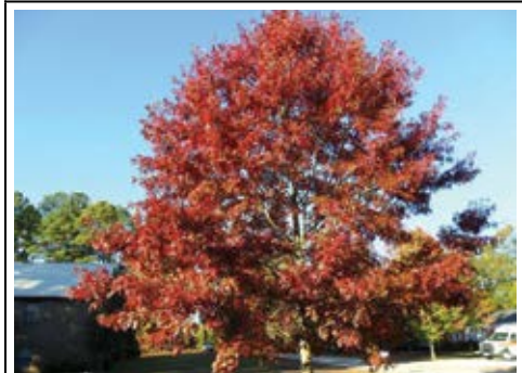
Persimmon Height: 20-30' Soil: moist to dry. Adapted to eastern half of Kansas. Full sun to partial shade. Slow growth rate. Used for wildlife habitat. Edible fruit.

Pin Oak Height: 70-90' Soil: moist, well drained. Adapted to eastern half of Kansas. Moderate growth rate. Used in windbreaks and acorns provide food for wildlife and timber. Native to Kansas.