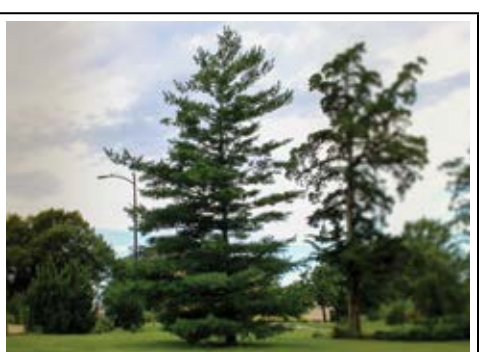
Eastern White Pine Height: 50-60' Soil: moist, well-drained. Adapted to eastern third of Kansas. Full sun to partial shade. Moderate growth rate. Used for windbreaks and Christmas trees.

Eastern Redcedar Height: 30-50' Soil: well-drained to dry. Adapted statewide. Full to partial sun. Moderate growth rate. Used for windbreaks and wildlife habitat. Very drought tolerant.