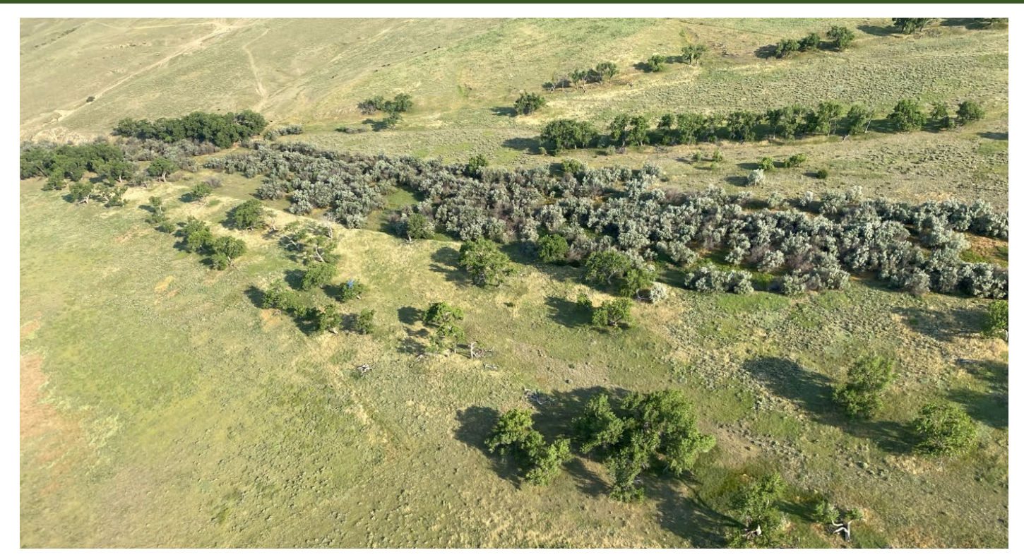
Photo above shows Russian-olive along the Arikaree in Cheyenne County.