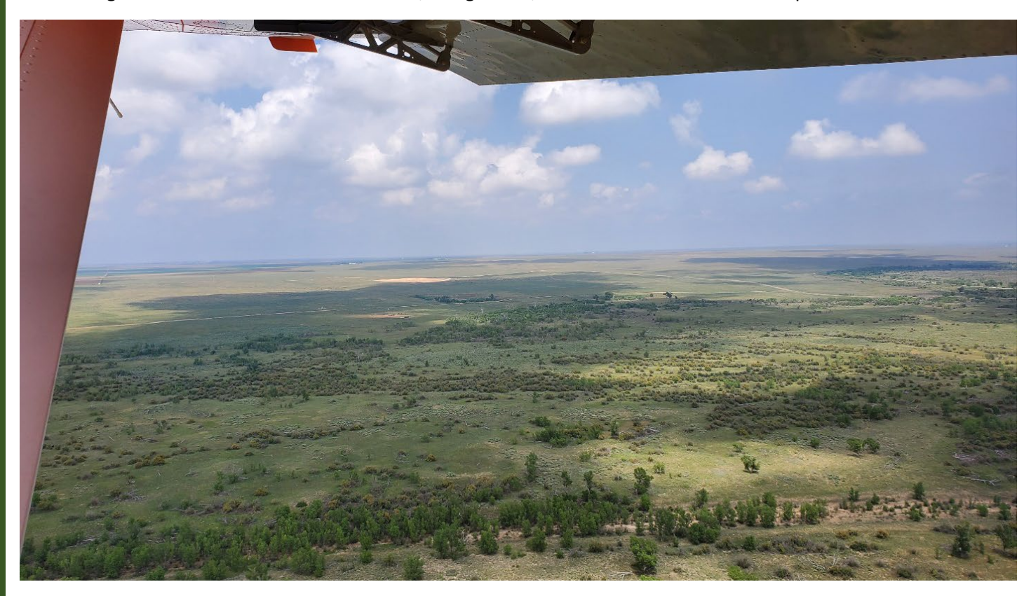
Photo above is typical view from plane, with tamarisk clearly visible along center of Arkansas channel.

For some areas surveyed, tamarisk polygons could not be created due to extrememly sparse densities, or due to heavy overstory cover. This resulted in an underestimate of tamarisk along the South Fork of the Republican River (SFRR) where this survey recorded 0 acres, although tamarisk is known to exist from previous ground survey information. This also likely resulted in an underestimate of tamarisk along the eastern stretches of the Smoky Hill due to hardwood tree cover along the river. Estimates of Russian-olive, a larger tree, did not suffer these same complications.