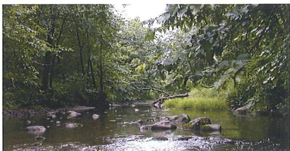
Figure 3. Natural woody vegetation should be left to protect streambanks.

These results show that woody vegetation is highly effective for protecting streambanks. Standing trees slow water movement, thus reducing the energy available for erosion and allowing deposition of suspended materials. Greater rooting depth, larger and stronger roots, and perhaps greater rooting density also stabilize the soil mantle.