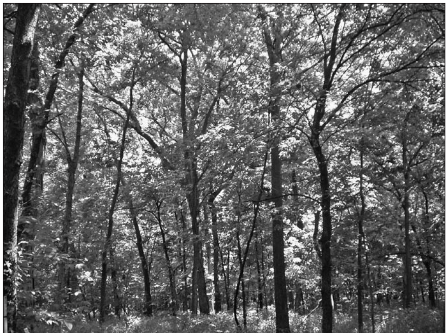
Figure 1. A healthy riparian forest buffer helps maintain and improve water quality.

The forest canopy (leaves and branches) also helps maintain water quality by providing shade to the stream, keeping water temperatures low and oxygen at adequate levels for aquatic life. The leaves, limbs, and trunks that enter the water naturally are a critical source of organic