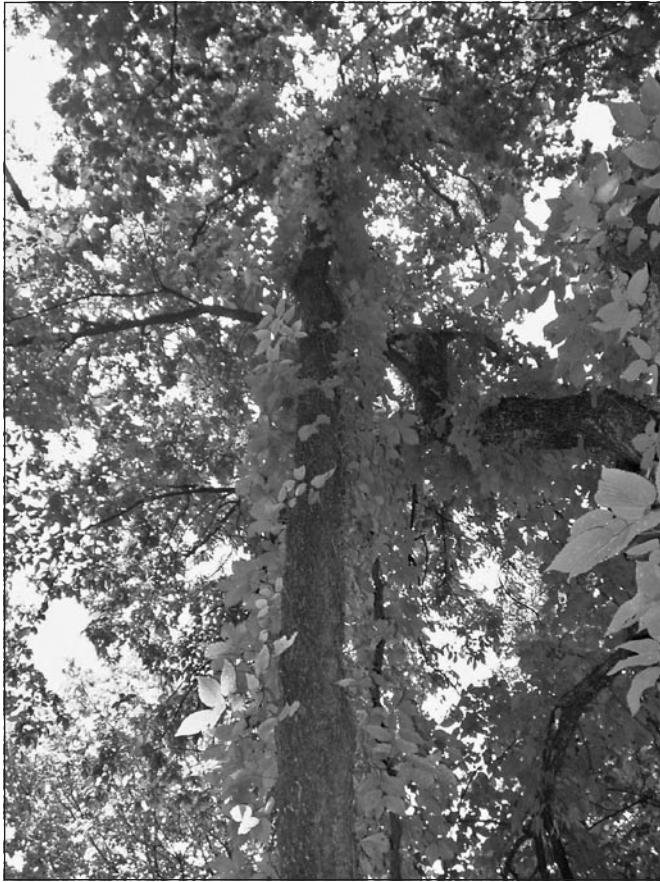
Figure 3. Vines on the trunk and branches of a hackberry tree.

wind or ice storms, which will also cause decline of the tree.